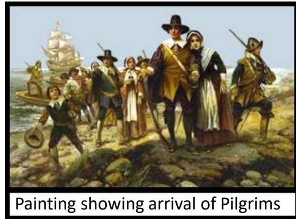
Painting showing arrival of Pilgrims

Norwegians traded goods with the native people who lived there, but they did not attempt to settle the area. Among the earliest of the European settlers were people known as Pilgrims. They arrived in Massachusetts, on a ship called the Mayflower , in 1620. They left England hoping for religious freedom, far away from the ruling King. The native people and the settlers had complicated